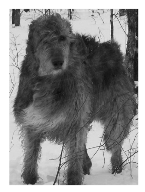
May All Enjoy the Fellowship! ELKHORN IRISH WOLFHOUNDS Study the Past, Consider the Present, and Preserve the Future