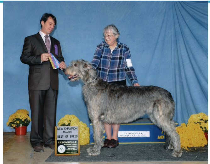
Pansy, AKA CH Silver Thorne's Heartsease , earned her Champion title on 12 Oct 2013!

The Maryland Irish Festival, November 8-10 at the Timonium Fairgrounds, was a huge success. Many club members and their hounds attended the festivities.