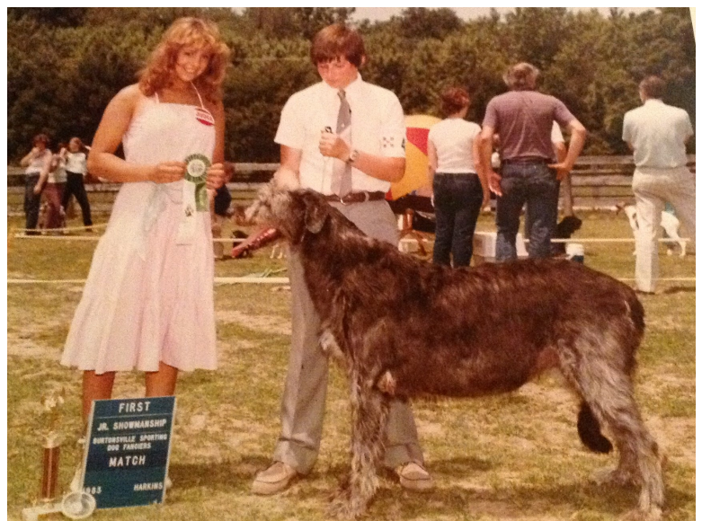
Avoca of Eagle