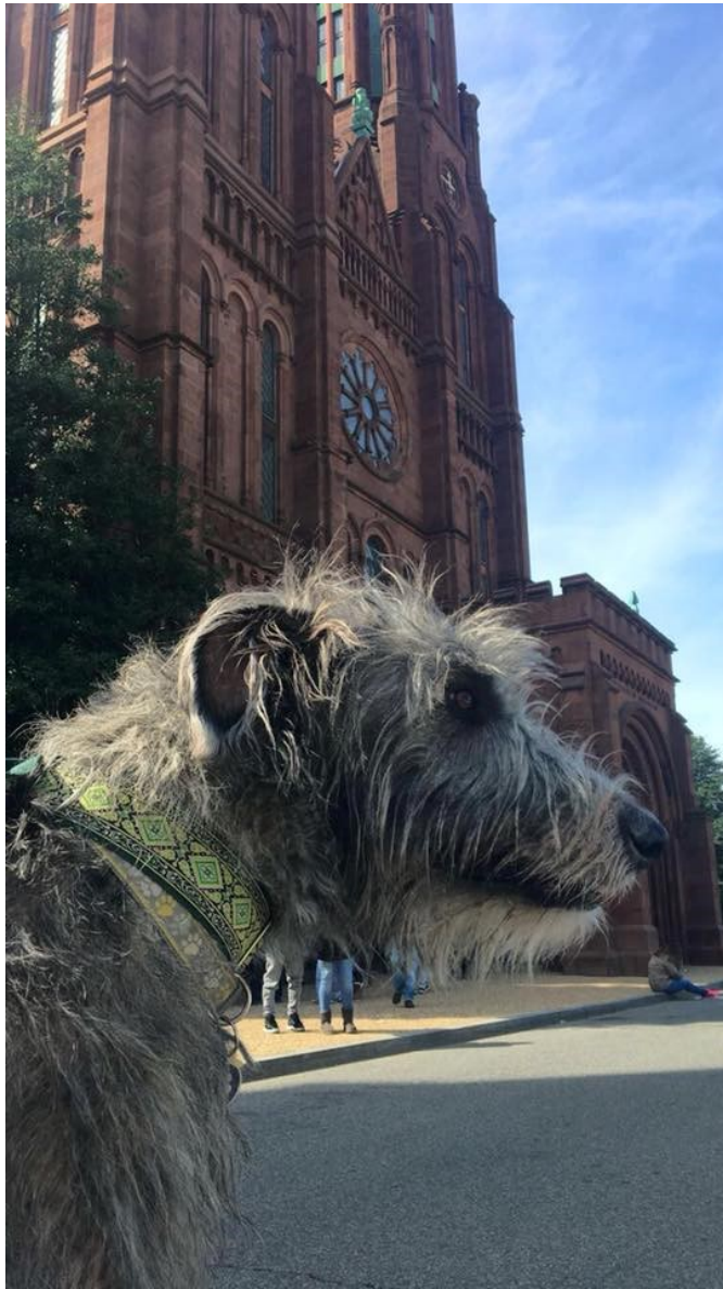
Grimm Finstad visits the Smithsonian.