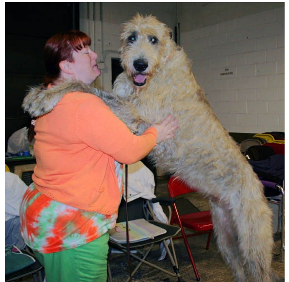
Aren't I wonderful?