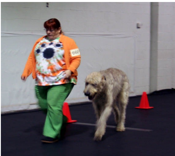
Straight figure 8 or serpentine

Rally Advanced is the middle level of Rally titles, and courses consist of 12-17 exercises, including 1 jump & no more than 7 stationary exercises.